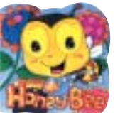
Honey Bee Nature's providing way.