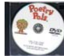
Visual / Audio Interactive DVD Item #034