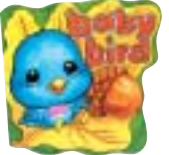
Baby Bird Illustrates acts of kindness