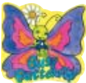
Busy Butterfly Dealing with rejection.