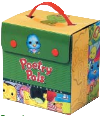
Set 1 Item #023 Carry Case with seven books