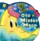
Ole Mister Moon The wonder of the heavens.