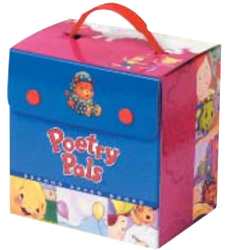
Set 2 Item #024 Carry Case with seven books