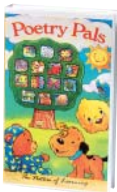
Video Item #003