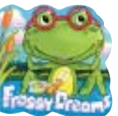
Froggy Dreams Dreaming is fun!