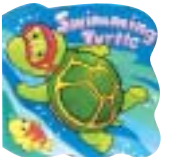
Swimming Turtle Stranger Danger!