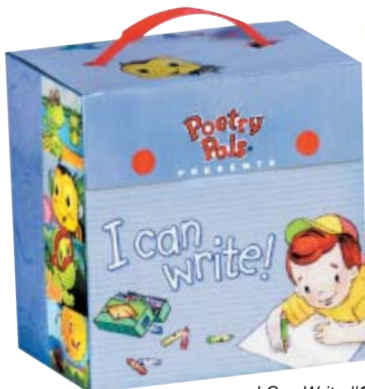
I Can Write #065