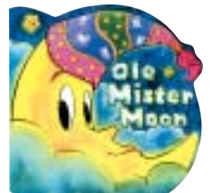
Ole' Mister Moon