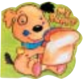
My Puppy Teaches responsibility and caring for pets.