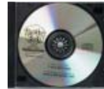
Audio CD Item #036

Also Available... Audio CD Interactive DVD and Audio Cassette